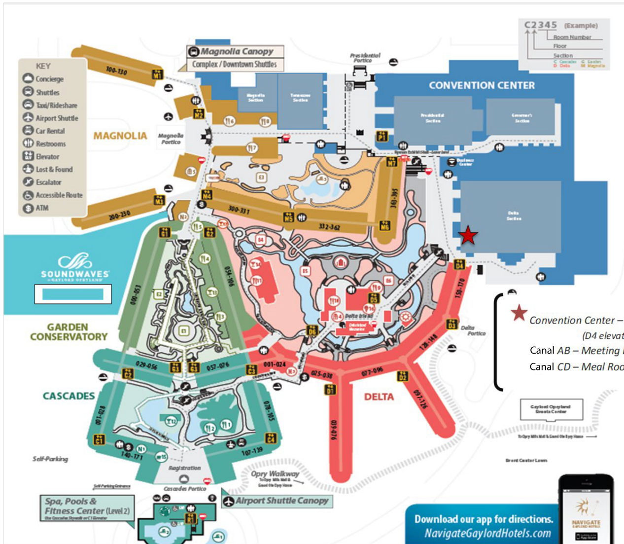
Conference Facility Map